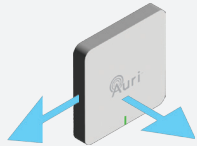
Vertical Mounting with Optimal Positioning Direction