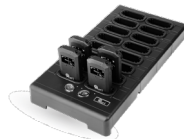
Auri D16 Docking Station 16