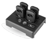
Auri D4 Docking Station 4