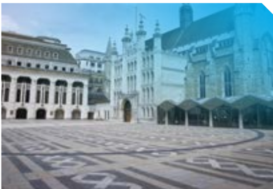
London Guildhall, London, UK

Ampetronic™ Loopworks™ productivity suite includes a powerful Measurement App, accessible Digital Drivers interface and comprehensive Specification and Design tools. The tools are powerful on their own, but when used in combination provide a holistic end-to-end solution to a hearing loop project that will save time/money and project/protect your reputation as an expert.