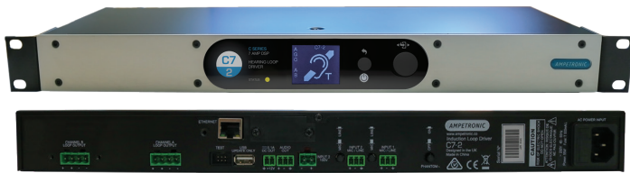
C Series (dual) amplifier

Training videos and product demonstrations can be viewed online at the Ampetronic™ YouTube Channel https://www.youtube.com/user/AmpetronicLoops