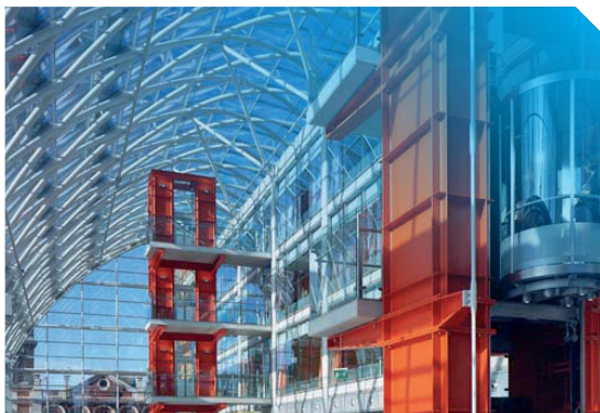
Evelina Children's Hospital, Lambeth, London, UK

Ampetronic™ Loopworks™ productivity suite includes a powerful measurement app, and comprehensive specification and design tools. Such tools can be used standalone or when used in combination provide a holistic end-to-end solution to a hearing loop project, which can save time and money.