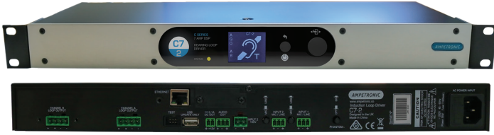
C Series (dual) amplifier

Training videos and product demonstrations can be viewed online at the Ampetronic™ YouTube Channel https://www.youtube.com/user/AmpetronicLoops