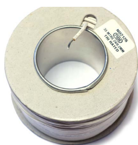
33m Roll Wire

The Ampetronic DLS transmits sound directly to a hearing aid or receiver as safe and invisible magnetic waves. The sound can be received when the user is within a loop, which can be very small – as small as a single chair or sofa – or which can be around a room or area up to 5 x 6m or 30m 2 . A larger room or area can be used if a lower signal strength is acceptable which will depend greatly on your hearing aids or receiver. A range of accessories is available to extend the flexibility of your DLS system, as shown below.