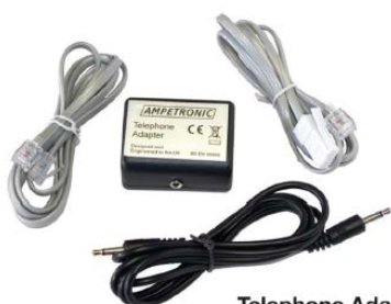
Telephone Adaptor Kit

A loop pad designed for permanent installation under a desk or counter is also available on request [Part Number GE00022].