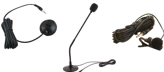
Desktop Microphone ACDTMIC