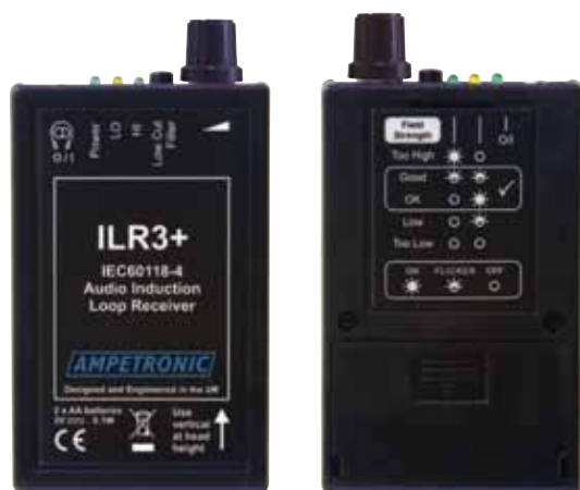
ILR3+ front view

The loop checking system comes with an easy to follow procedure for checking any loop system.