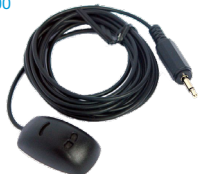
Boundary Microphone Q400