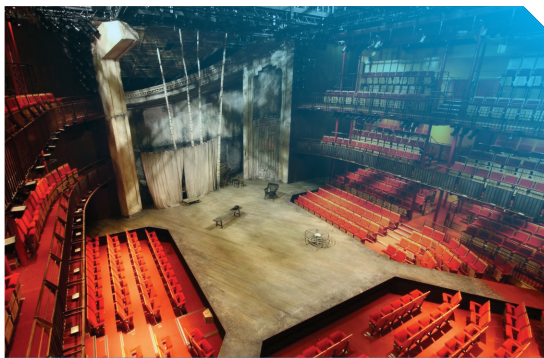
Ampetronic Hearing Loop installed in Royal Shakespeare Courtyard Theatre, Stratford upon Avon, UK

Ampetronic™ Loopworks™ productivity suite includes a powerful measurement app, and comprehensive specification and design tools. Such tools can be used standalone or when used in combination provide a holistic end-to-end solution to a hearing loop project, which can save time and money.