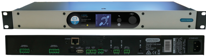
C Series (dual) amplifier

Training videos and product demonstrations can be viewed online at the Ampetronic™ YouTube Channel https://www.youtube.com/user/AmpetronicLoops